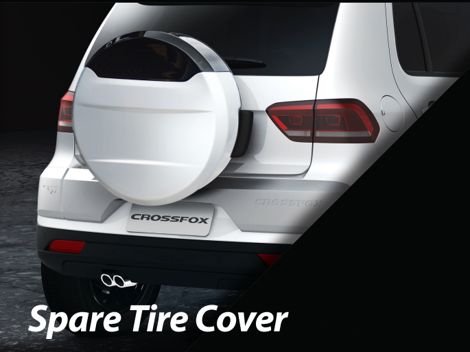
Spare Tire Cover