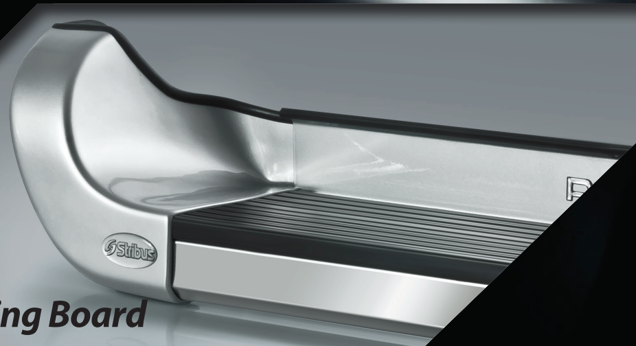
Original Running Board