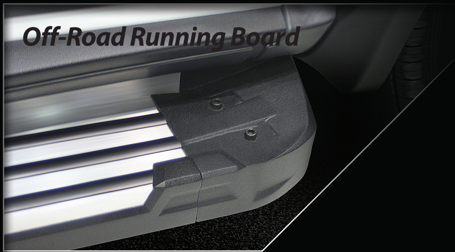
Off-Road Running Board